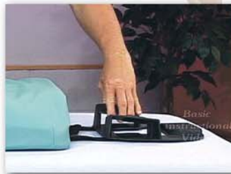
Place "Fresh Air" base flat on table

"Fresh Air" base provides abundant airflow..