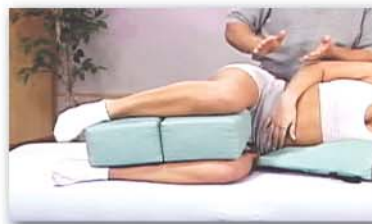
Place Leg Support between legs or under top leg (shown above)