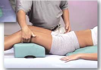
Thighs rest on angled side of leg support, Drop down for hips alleviates pressure