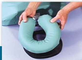
Adjust inward for a narrow face