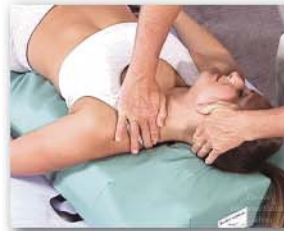
Breast recesses stabilize head during lateral flexion