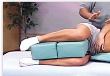
or between the legs