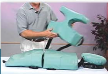
Attach breastProtector velcro to the Pelvic and Face Supports