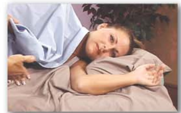
Draping for side lying