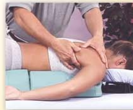
Arm placed at side allows scapulae to move laterally