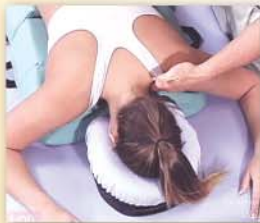
Position clavicles at highest point of Chest Support and ASIS at the highest point of the Pelvic Support