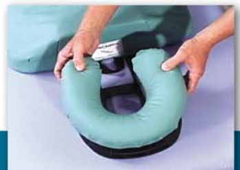
or outward for a wider face