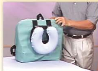
Fold the Chest and Pelvic Supports together, then place on lap with Chest Support facing client's body