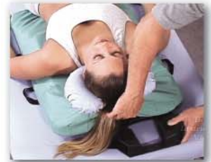
Face Crescent Base under chest can correct for cervical extension