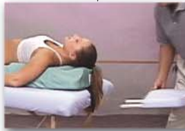
Table extender is removed with the Face Support .