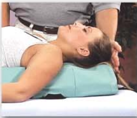
Position head at end of Chest Support and sacrum on medial ramp of Pelvic Support