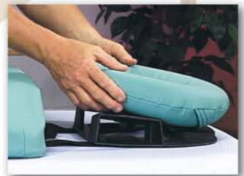
Face Crescent attaches with velcro