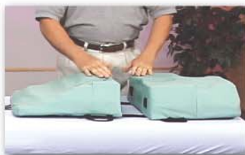
Separate Chest & Pelvic Supports to create space for the shoulder and arm