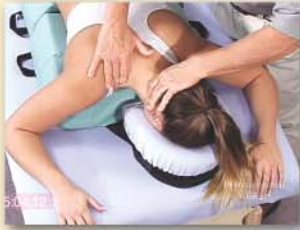
Freely moveable Face Support allows lateral flexion of the neck