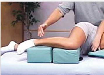
Use under top leg when side lying