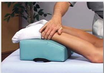
Support ankles when face down