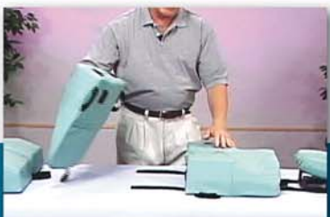
Detach Chest Support