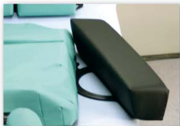
Slides securely under bodyCushion