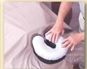
Cover bodyCushion with sheet and place Face Crescent on top