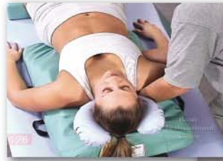
Access to the spine